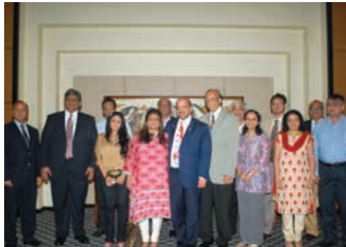
The Bhavishya Yaan Team