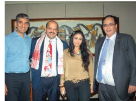
The Fund Raising and Public Relations Team