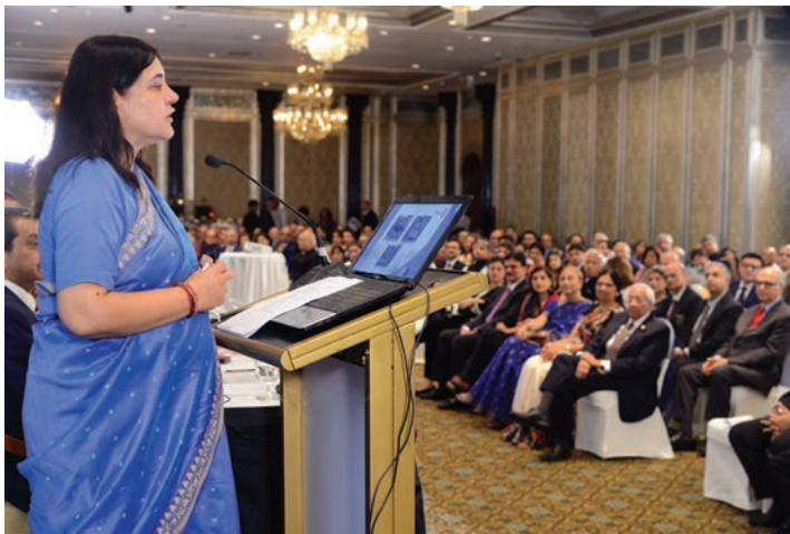
Mrs. Maneka Gandhi enthralls the audience by her committed spirit and her drive to make a difference in every child and woman's life