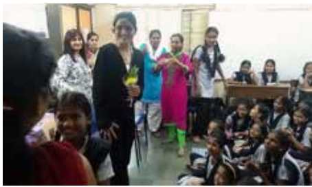
Actress Madhoo Shah charms her audience

With an aim to introduce children to various career options in visual and performing arts, as well as in creative writing, a two-day art workshop, on the 8th and 9th July, was conducted at the G.K Marg Municipality School, Worli.