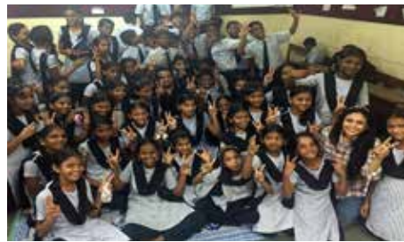
Happy students pose for a photo opp!