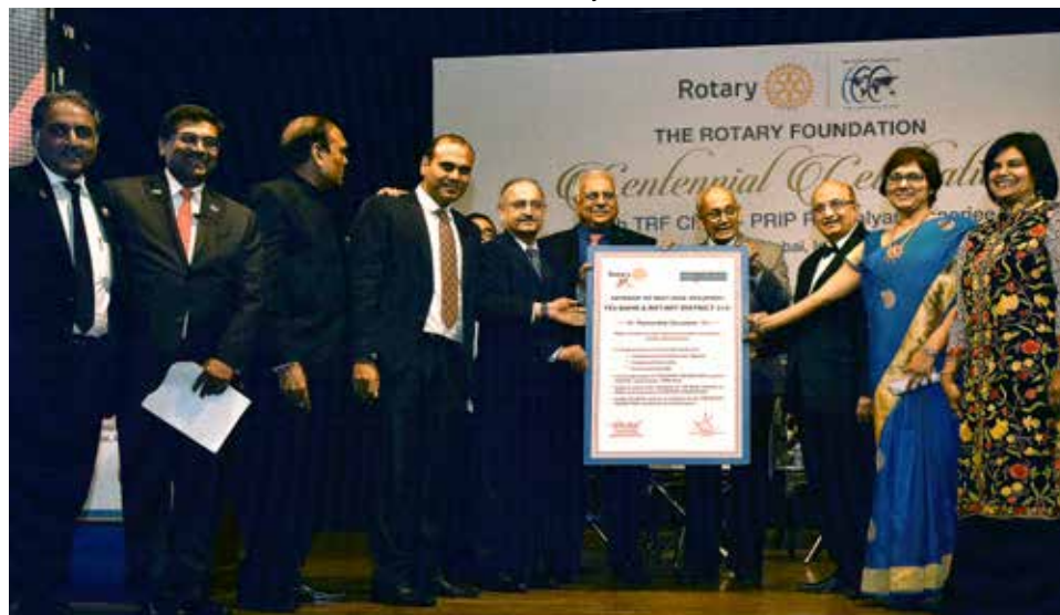
Rotary Club District 3141 partners with Yes Bank for India's Social Development

who, through volunteer service, help meet the needs of communities worldwide.