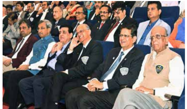
Co-hosted by 16 clubs, the felicitation witnessed a turn out of over 350 members