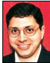
Farokh Balsara 25th November