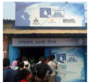
The first Jal Jeevan Centre at the Rafi Nagar Slums in Govandi