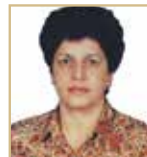
Arin Master 16 January