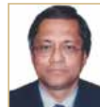
Subrata Mitra 16 January