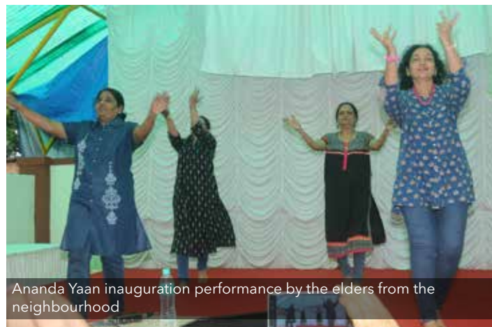
Ananda Yaan inauguration performance by the elders from the neighbourhood