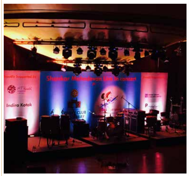
The calm before the storm

We just can't get over this event from last month, can you?