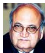
Hon. Rtn. Keshub Mahindra 9 th October