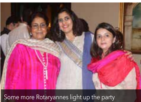
Some more Rotaryannes light up the party