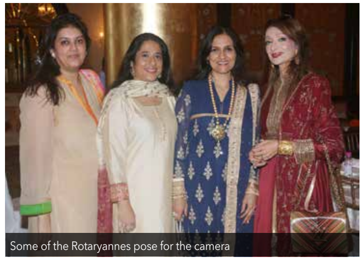
Some of the Rotaryannes pose for the camera