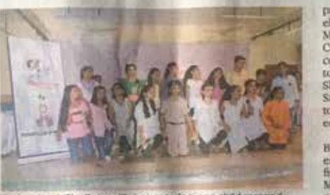
A group photo of children and adults.