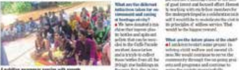
A group photo of children and adults.

To support the club's activities, the club has been active in many social service projects. It is the oldest club in the city and has been active in many social service projects. It is the oldest club in the city and has been active in many social service projects.