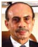
Hon. Rtn. Adi Godrej 3 rd April