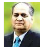
Hon. Rtn. Rahul Bajaj 10 th June