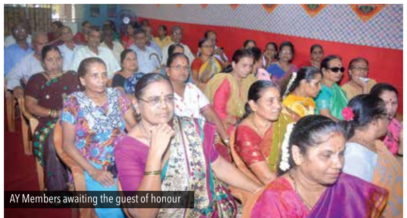
AY Members awaiting the guest of honour