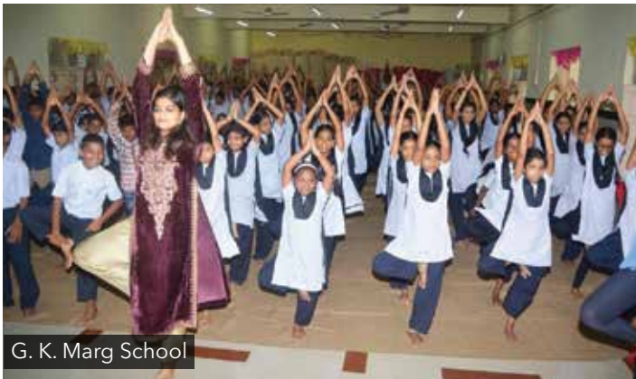
G. K. Marg School