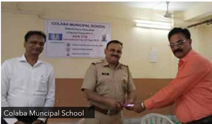
Colaba Municipal School