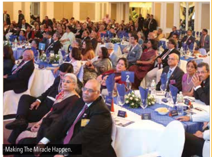
Making The Miracle Happen.