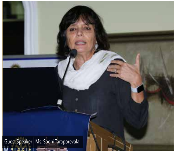
Guest Speaker - Ms. Sooni Taraporevala

P adma Shri recipient Sooni Taraporevala has permanent displays for her photographs in the National Gallery of Modern Art, Delhi and the Metropolitan Museum of Art, New York. Her work has also been exhibited in art galleries across the USA, France, and in the Tate Modern Gallery in London.