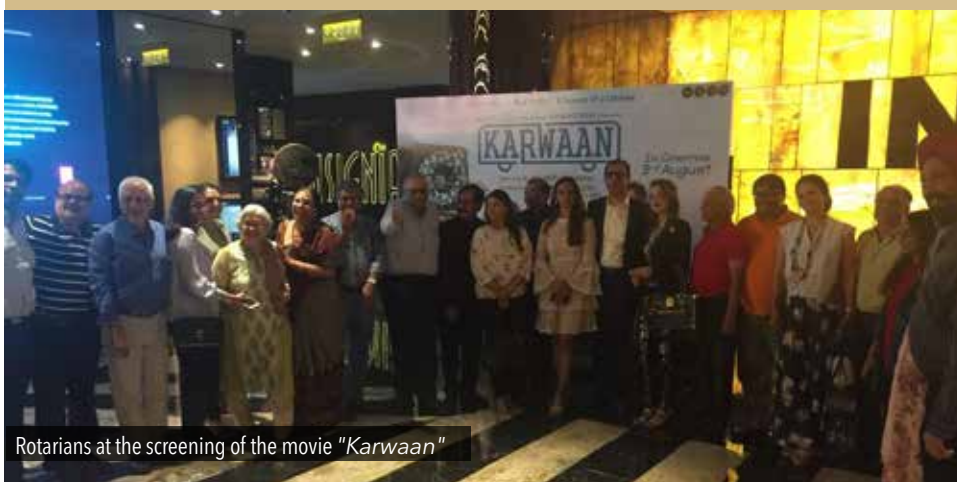
Rotarians at the screening of the movie "Karwaan"

Rotary Club of Bombay brings back Movie Fellowships with a bang!